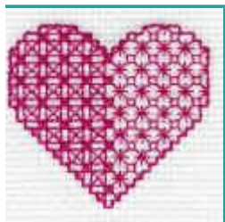
Valentine 2004 - copyright Jan Eaton 2004

ere's your free chart for February 2004 - the design is 27 stitches wide x 25 stitches high. lick on the colour picture to see a larger image, then use your browser's back button to return here.